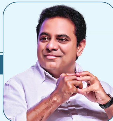
Sri KT RAMA RAO

Minister for Industries, Information Technology, Municipal Administration & Urban Development and NRI Affairs.